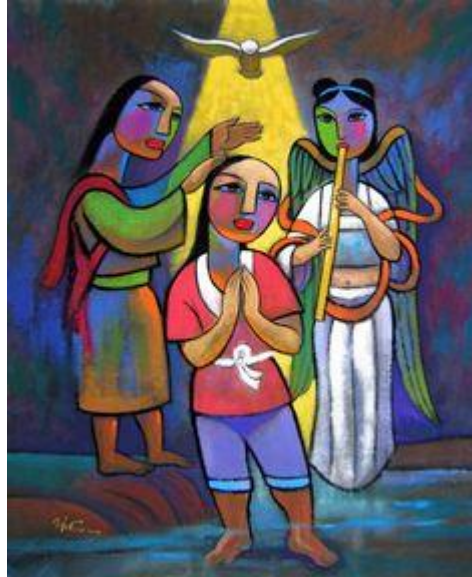
HE QI, THE BAPTISM OF JESUS