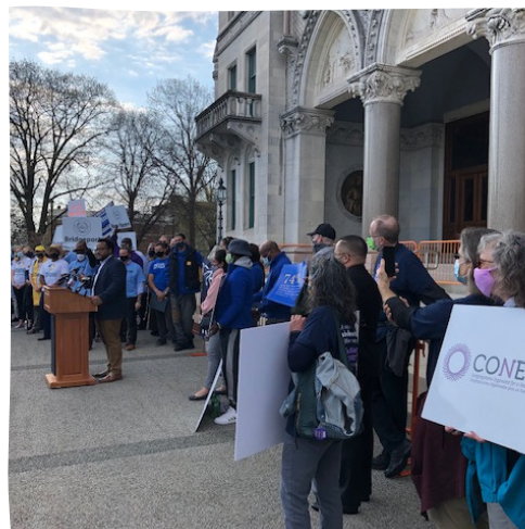
April 21 Clean Slate at the Capitol