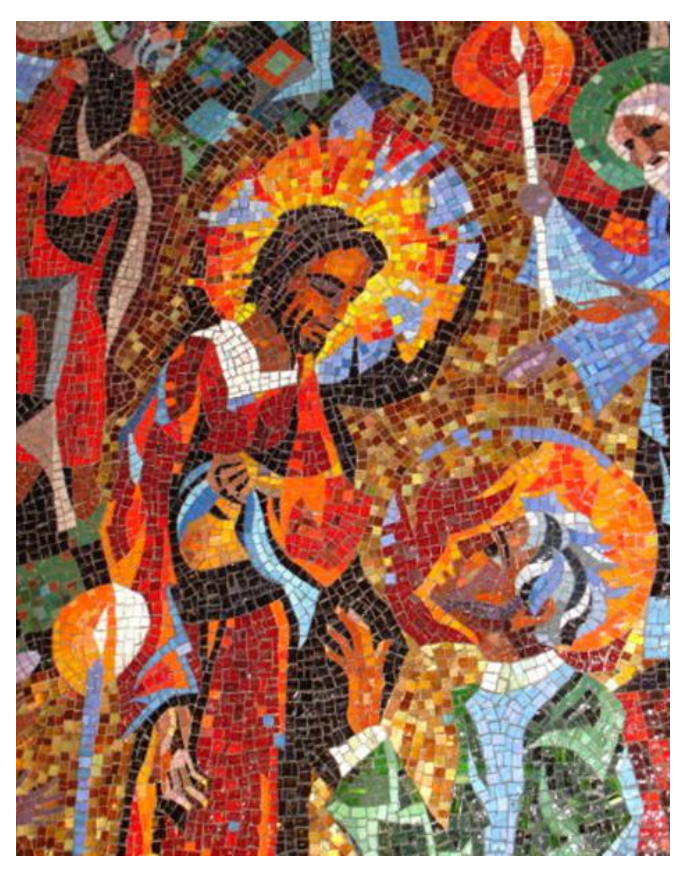
Christ Shows Himself to Thomas,, Mosaic at Washington National Cathedral

An Open and Affirming Congregation of the United Church of Christ