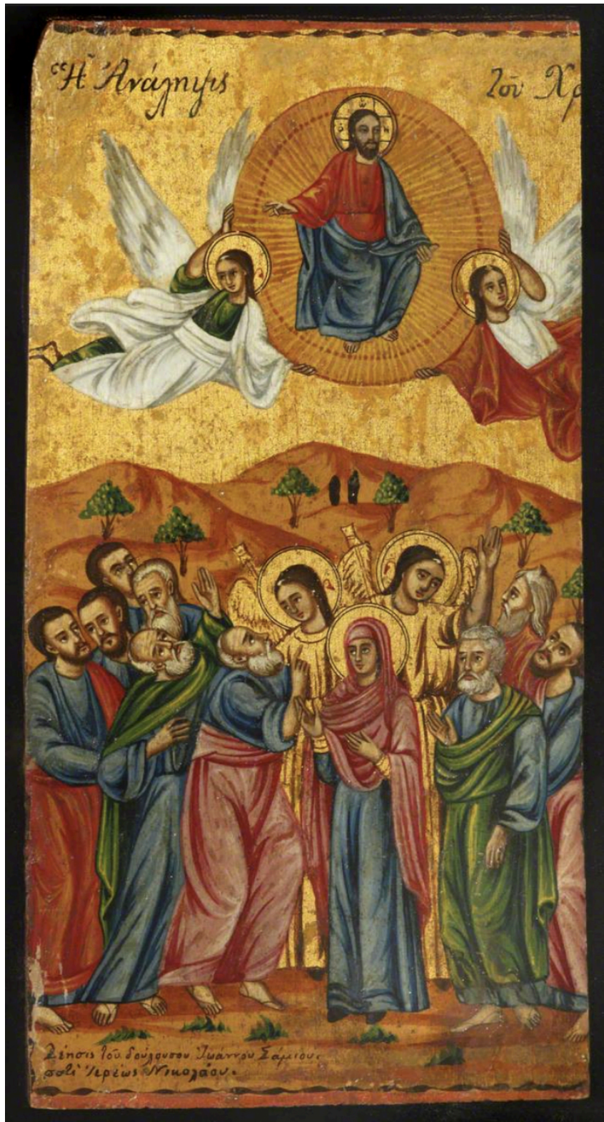
Icon with the Ascension of Christ, Oxford University