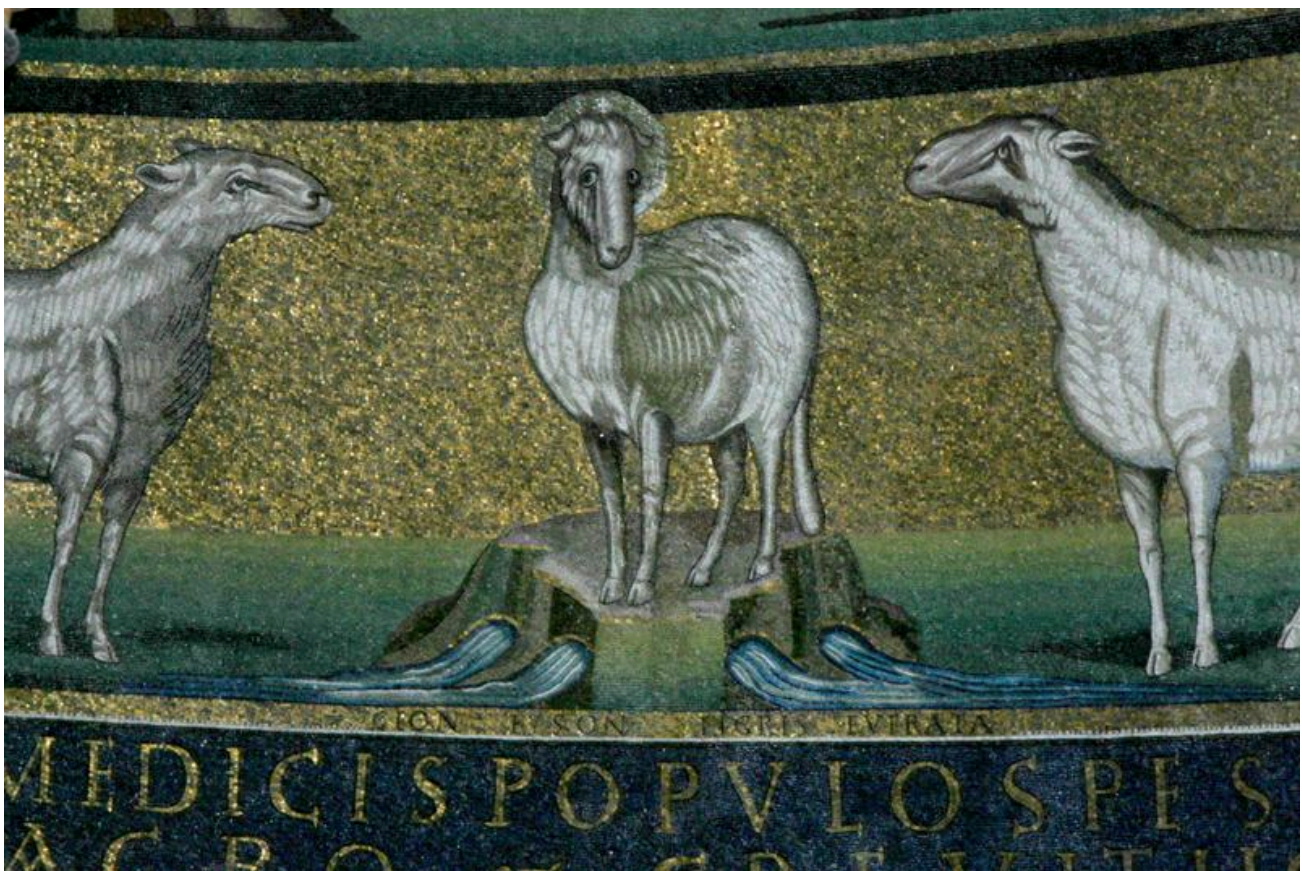
Lamb of God,, Mural at Basilica of Cosmas and Damien, Rome

An Open and Affirming Congregation of the United Church of Christ